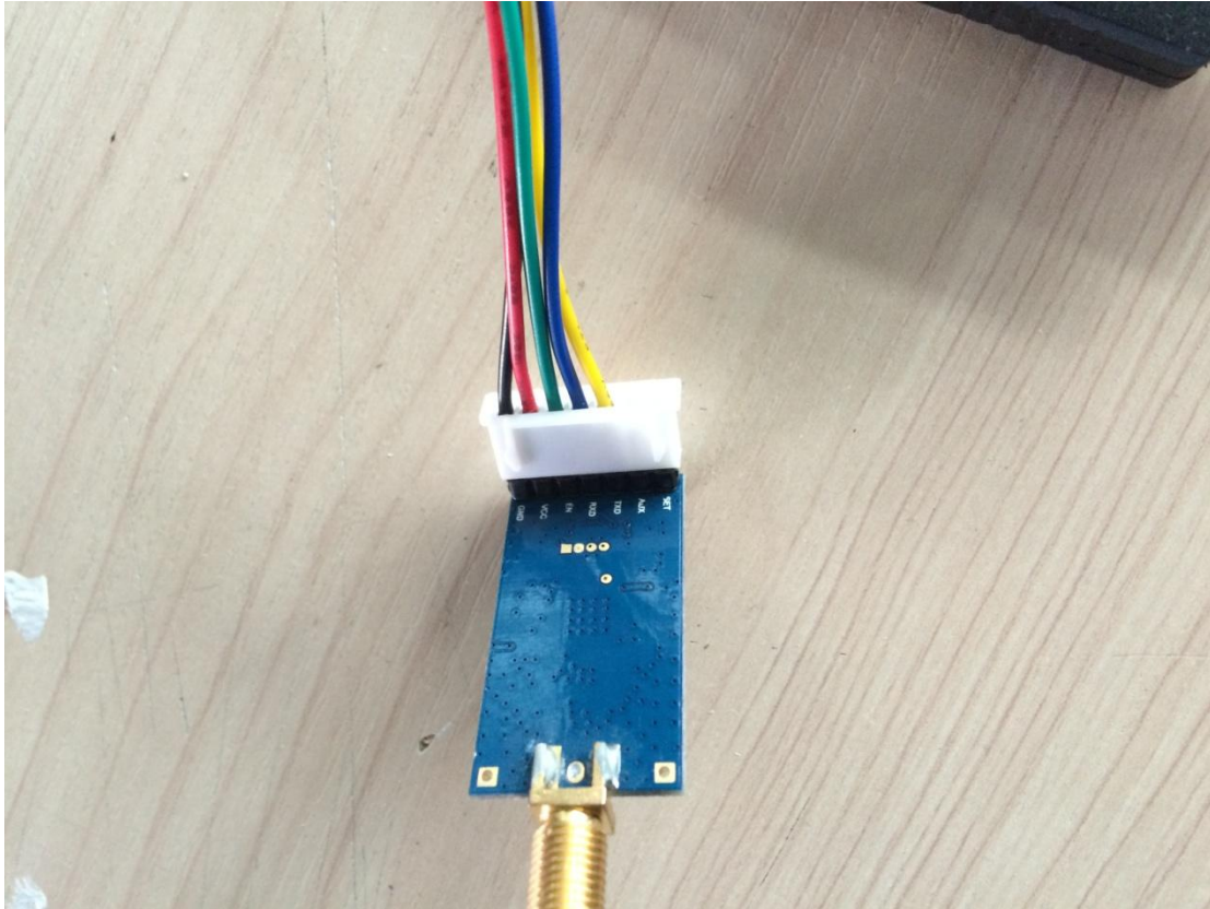
Figure 4 RF1276T connection